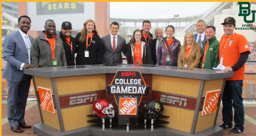
Above: College Gameday vs. Oklahoma, November 15th, 2015