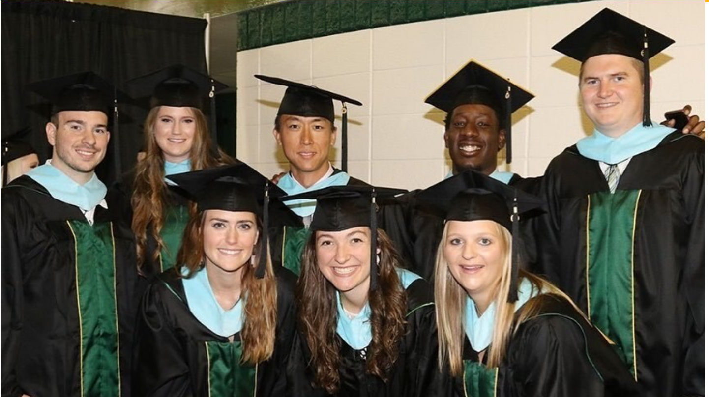
Spring 2019 graduates ready to launch their careers